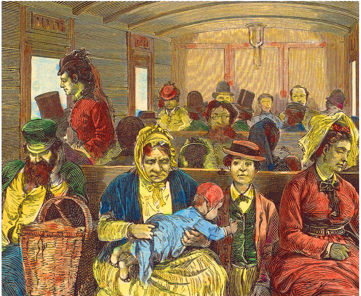
Travelling by the 3rd class was much less comfortable

With regard to the small loading capacity the length of carriages was increased by adding a third axle in the middle. The third axle had a sliding design to ensure that the wooden frames withstood the load of the cargo. This solution was used in both passenger carriages and freight wagons. Ultimately, Diamond bogies were used for freight wagons and bogies with variable suspension stages (2, 3 or 4) were used for passenger carriages.