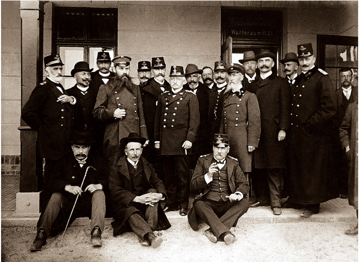
The opening of the Kraków - Kocmyrzów line - 1899