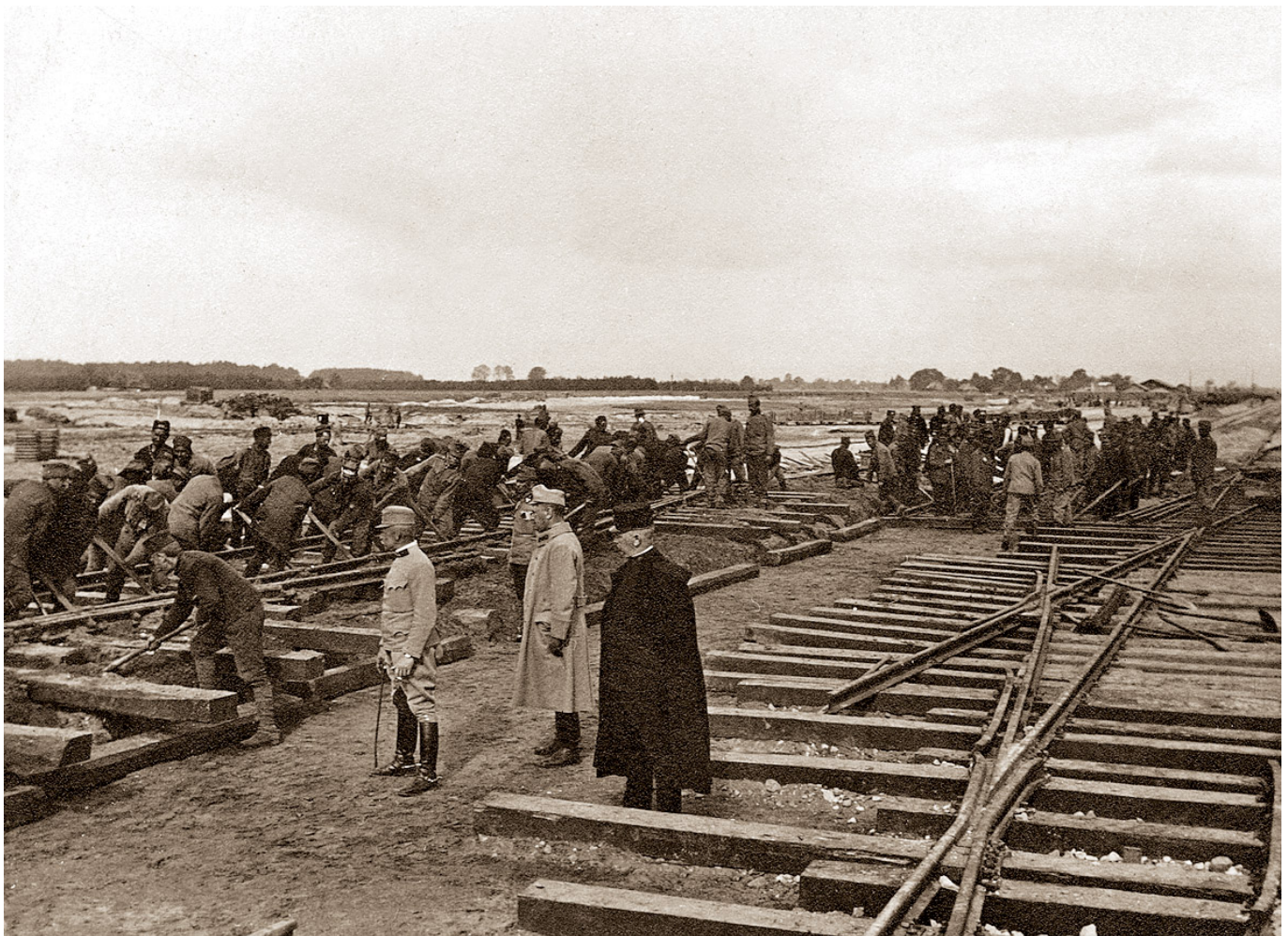
Inspection of the progress of works on the Galician Railway construction site - end of the 19th century

The Austro-Hungarian government implemented a railway nationalisation plan under which the lines from Przemyśl to Łupków - owned by the First Hungarian- -Galician Railroad - and the Lviv-Chernivtsi Railway were transferred to state administration in 1889. They reported to directorate districts formed in 1884 in Kraków and in Lviv (and to the superior State Railways Directorate in Vienna). The Emperor Ferdinand Northern Railway was bought from private owners in 1906 and put under the direct administration of the directorate in Vienna.