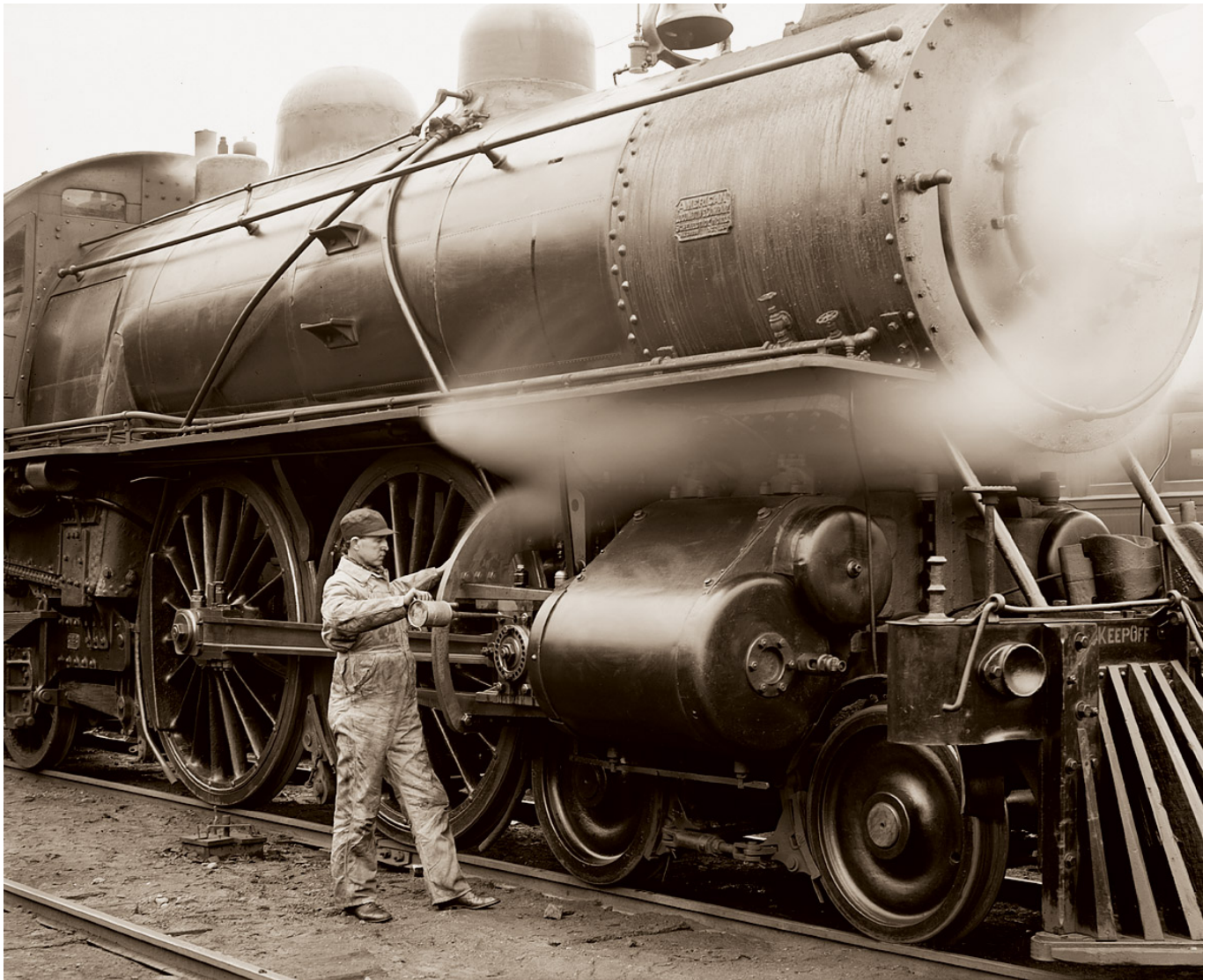
Lubricating the engine before departure - USA, 1904

The benefits of the introduction of the railway were evident to everyone. So, not only the existing lines in England or the United States were extended but new ones were built, in particular in Europe. In 1844 a railway was put into operation by the Danes (in what is now Germany) and the Swiss. In 1848 the railway reached Spain, in 1849 - Sweden (narrow-gauge), in 1854 - Norway, in 1856 - Portugal and in 1869 - Greece. On the other hand, in 1842 the first railway line was put into operation in what is now Poland (Wrocław-Oława). In turn, in the Kingdom of Poland dependent on Russia, the construction of the first railway line was initiated as soon as in 1835, that is, 7 years before a line was built in Silesia then under the rule of more affluent Prussia. However, the project was completed only on 14 June 1845, when the suburban section of the future Warsaw-Vienna line was commissioned (finished in 1848). At the end of the 19th century the length of the railway lines over the world exceeded 497,000 miles (800,000 km).