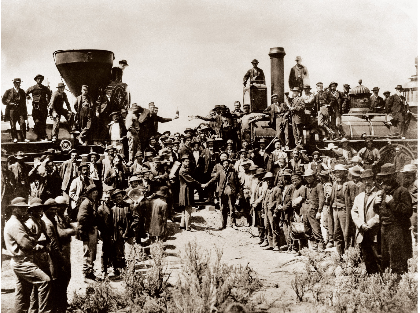
The historic moment of connecting the sections of the Union Pacific and Central Pacific lines - USA, 1869

Steam-powered traction was predominant in the railway industry for nearly 100 years. Things changed with the introduction of electric and diesel traction. An electric locomotive turned out to be a particularly dangerous competitor of a steam locomotive. It was presented for the first time - on 31 May 1879 at the Berlin Industrial Exposition - by a German inventor, Ernst Werner von Siemens. It was a small locomotive driven by a 2.5 kW motor, supplied with electric power through a third rail. The electric locomotive was soon improved and in 1881 the first section of the electrically-propelled railway was commissioned on the route from Berlin to Lichterfelde, and in 1903 on the Berlin-Zossen section the electric locomotive broke a speed record travelling 131 miles (211 km) in one hour. And the first diesel locomotive was presented in 1891 by another German inventor - Gottlieb Daimler. The structure was put into service in Germany in 1912.