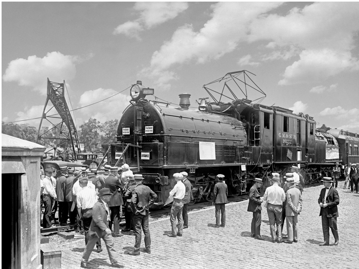
The largest American electric locomotive owned by the now non-existent company Chicago, Milwaukee, St. Paul and Pacific Railroad, supplied with 3,000 V DC - 1924

countries, in Italy, Spain, the Czech Republic and Slovakia. One of the most popular voltages used by the railway industry is now 25 thousand volts AC with the frequency of 50 Hz. This system has another great advantage, apart from those mentioned before, that is, it can transform the voltage to match its frequency with the frequency of industrial networks (household power sockets also use this frequency). Thus, only a small number of simple traction substations are required and the voltage value will send energy through small diameter (light) cables keeping losses at a low level. This type of supply is used, for example, by Chinese, British, Spanish and Japanese railways. It is worth mentioning that it is also used to supply energy to fast railways (TGV, Shinkansen, and Pendolino).