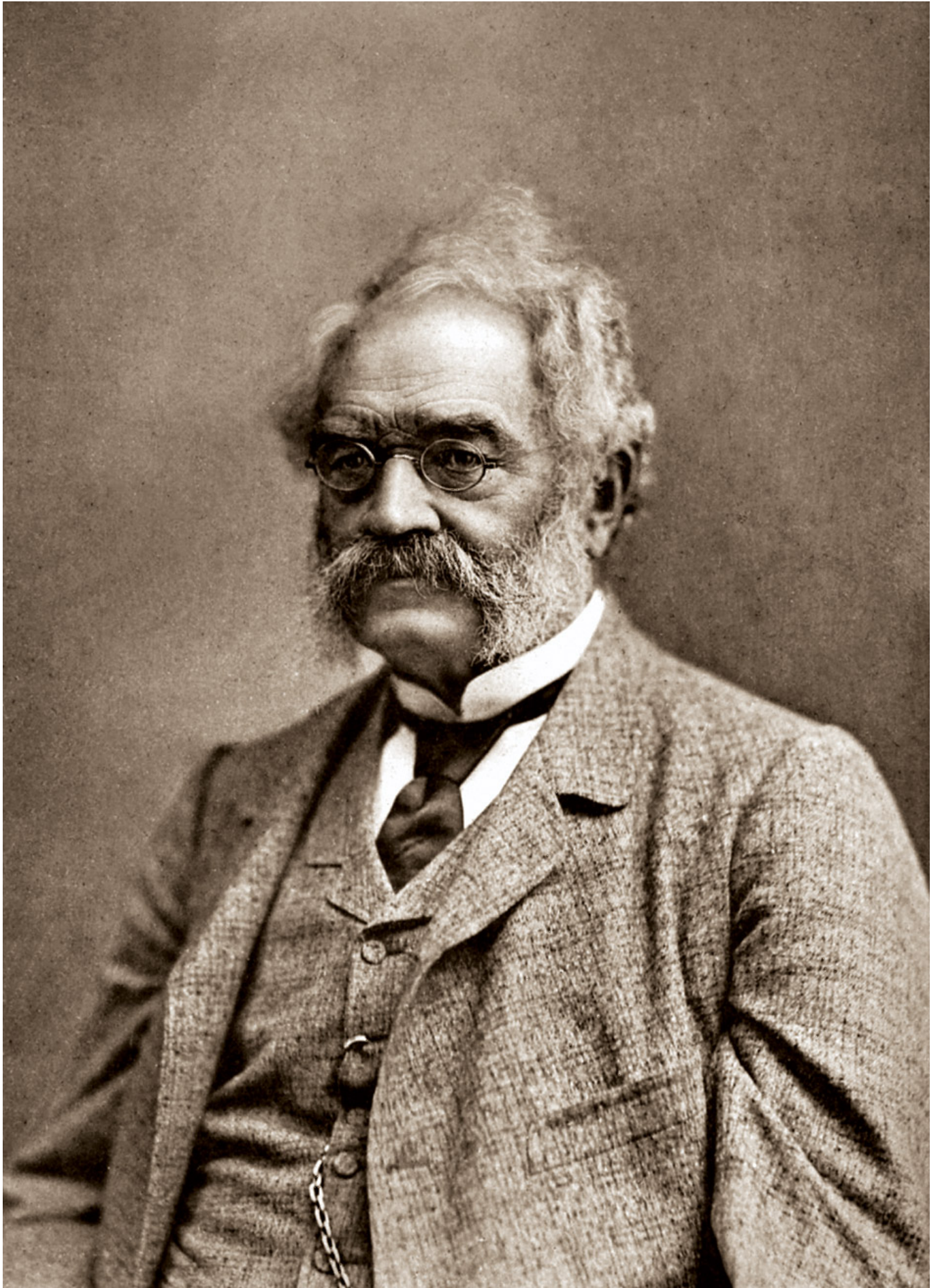
Ernst Werner von Siemens (1816-1892) - one of the most outstanding electrical engineering inventors