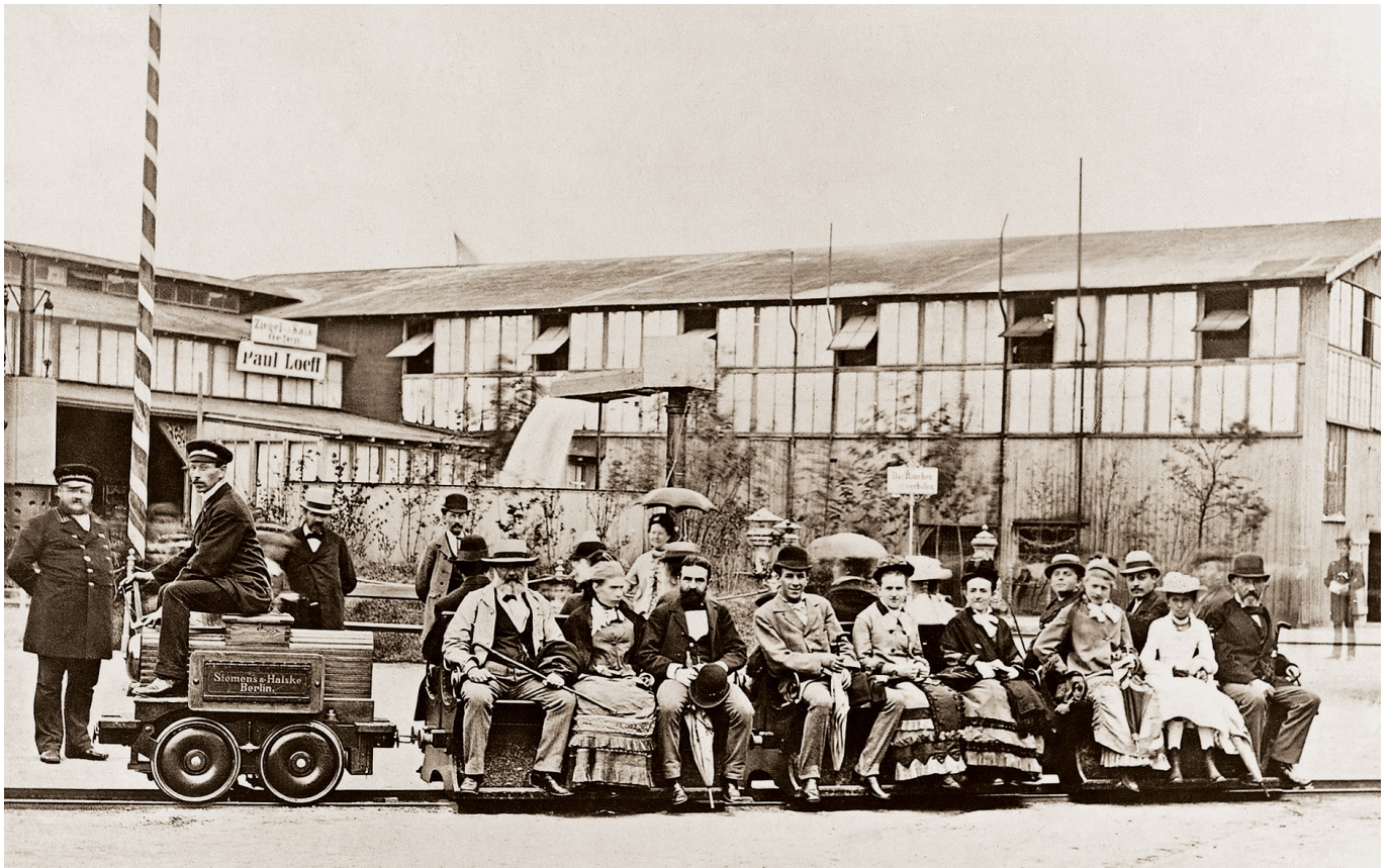
Ernst Werner von Siemens' electric rail at the Great Industrial Exhibition in Berlin in 1879