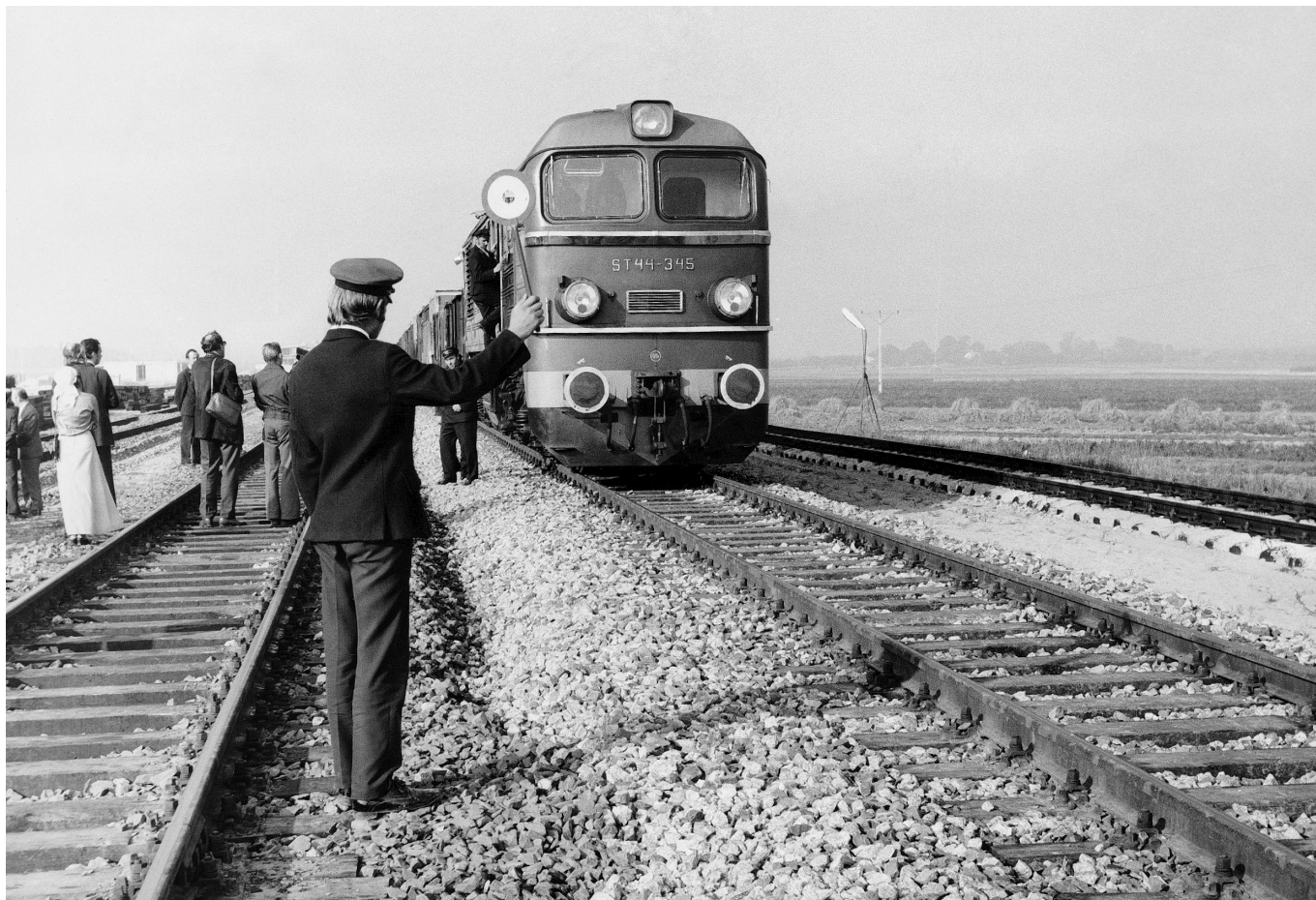
The first train on the Central Mainline - 1974

The electrification of railways progressed quickly. In 1978 the construction of electric traction was completed along with the refurbishment of the Poznań-Szczecin Główny line (133 miles, i.e. 214 km). One year later it reached Goleniów, and in 1980-Świnoujście. Also, the East-West Mainline was electrified: Poznań-Zbąszynek (1979)-Rzepin (1984), Łuków-Biała Podlaska-Terespol (1980)-state border (1981). The speed of works increased up to 311 miles (500 km) a year. Domestic manufacturers were not able to provide sufficient rolling stock supplies, so in the 1970s locomotives had to be imported from Czechoslovakia (ET40; 60 units) and the USSR (ET42; 50 units). In the critical year - 1981 - electric trains departed from Zgierz to Kutno and from Herby through Wieluń to Kępno. In total 4,350 miles (7,000 km) of railway lines were electrified.