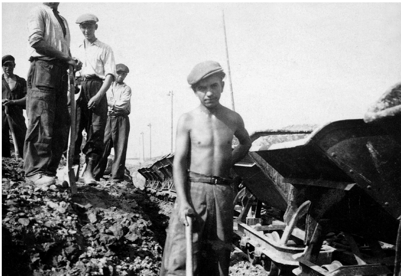
The construction of the Broad Gauge Metallurgy Line - 1979