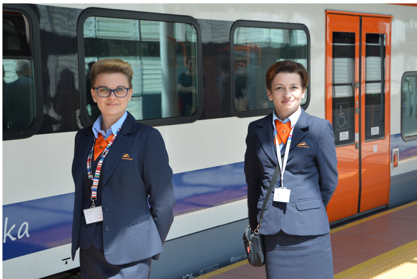
Onboard service crew of Koleje Małopolskie (Lesser Poland Railways)

In addition, the number of passengers on international and cross-border trains launched by Koleje Dolnośląskie, Przewozy Regionalne and Koleje Śląskie also went up. Next to PKP Intercity, international transport was also handled by other carriers such as: UBB (13%), Koleje Dolnośląskie (5%), Przewozy Regionalne (3%), and Leo Express (0.22%) and Koleje Śląskie (0.2 %). In 2018 and 2019 passenger carriers had a smaller number of traction units and wagons than in the previous years. It was connected with the ending life cycle of their rolling stock or with the process of modernisation of the vehicles. Restoring local railway infrastructure to operation increased the number of diesel traction units.