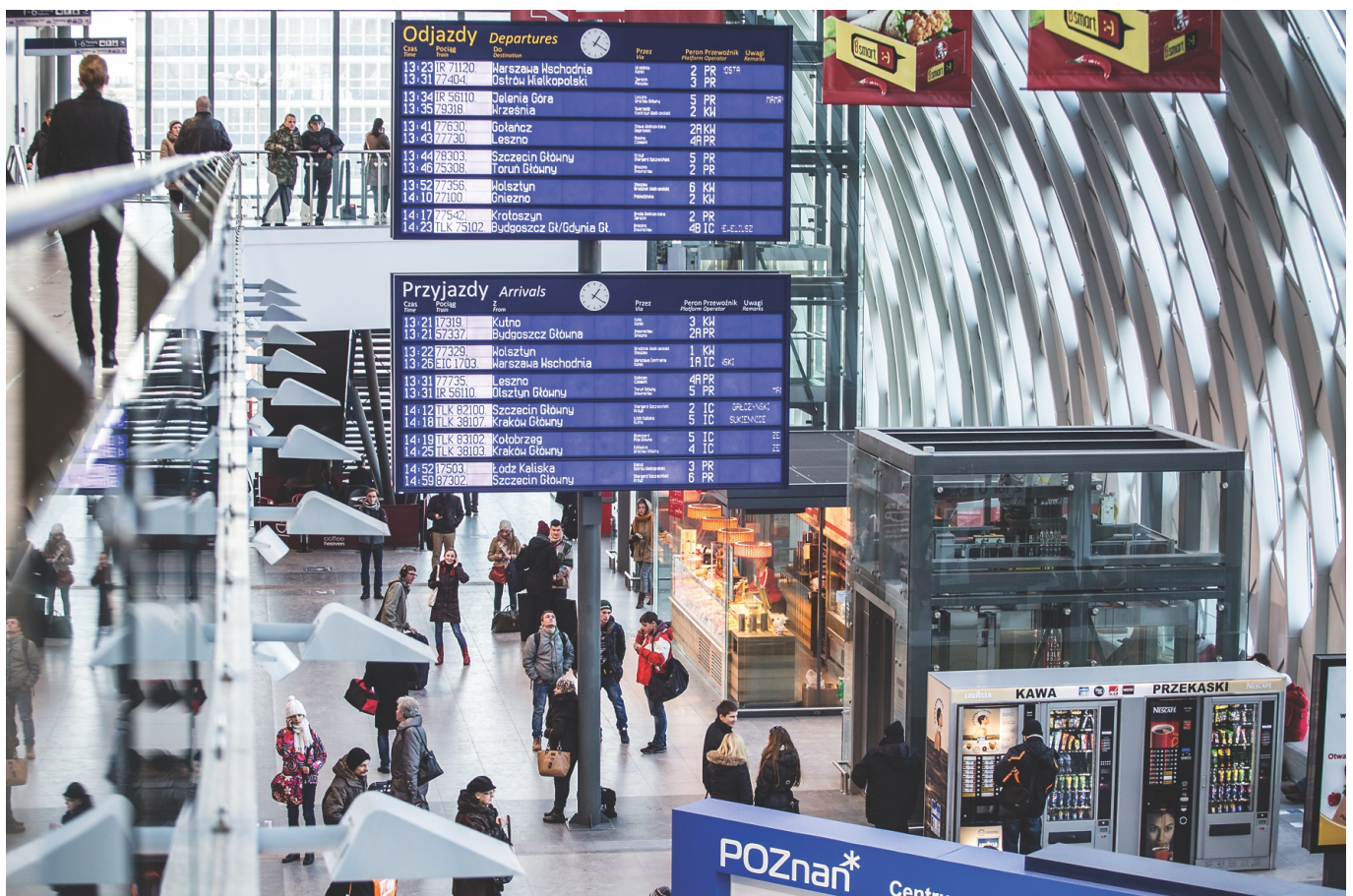
The new hall of the Main Railway Station in Poznań

An increase in the number of passengers has also been observed for long-distance, regional and metropolitan carriers. In 2019 the largest number of passengers used the services of Przewozy Regionalne (POLREGIO brand), Koleje Mazowieckie, PKP Intercity and PKP SKM in Tri-City (more than 72% in total). The largest number of people, that is nearly 89 million, used the services of the railway carrier company Przewozy Regionalne. This is 7.7 million passengers more than a year before. This carrier plays an important role in regional railway traffic providing its services to smaller localities.