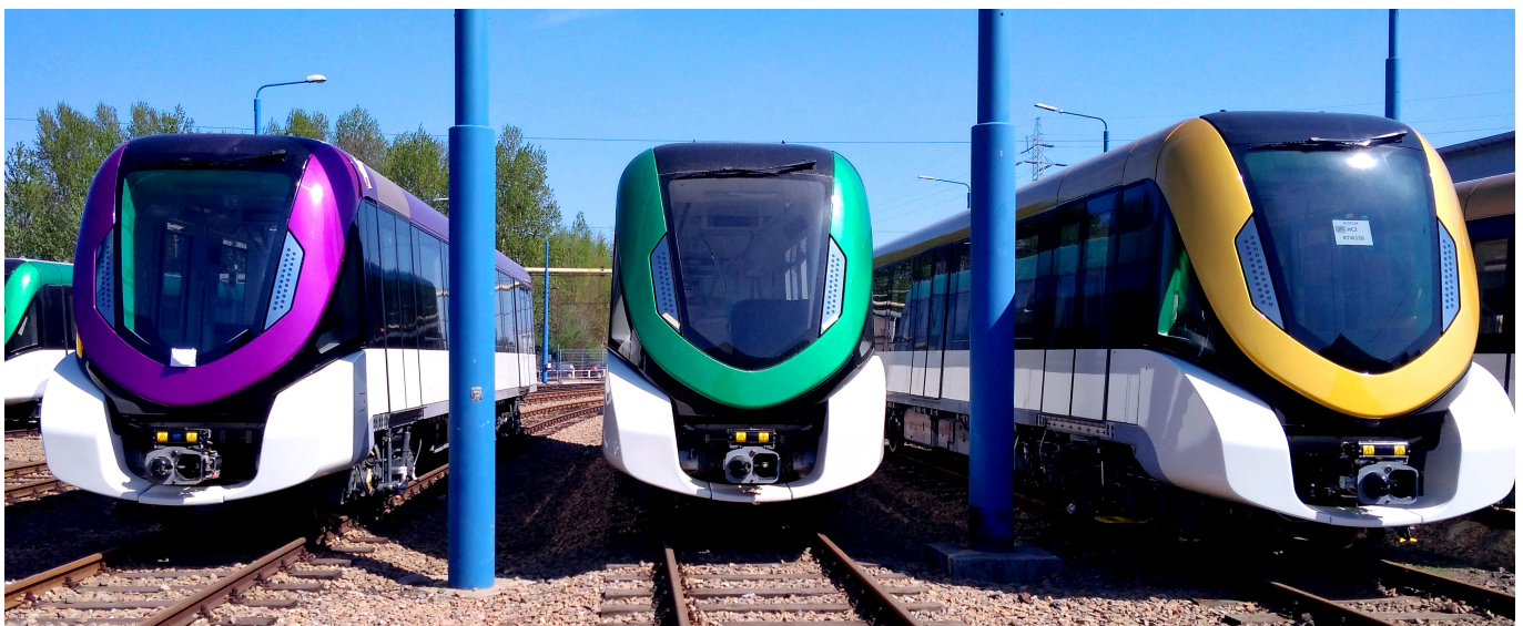
Modern rolling stock manufactured by French company Alstom

Seventy-one applications refer to so-called line projects (i.e. modernisation, refurbishment, reconstruction or construction of new railway lines), and twenty-five of them covered single-site projects (i.e. railway links, passenger service infrastructure - platforms, stops, railway traffic controls, and alteration of track systems). The applications will be evaluated for compliance with formal requirements to determine their eligibility for the next stage. Later, local governments will have 12 months for developing a preliminary planning and forecasting study. When the second stage is completed, the projects will be evaluated according to multiple criteria, based on which they will be included in a ranking and their eligibility for the Programme will be determined. The completion of the Programme is planned by 2028.