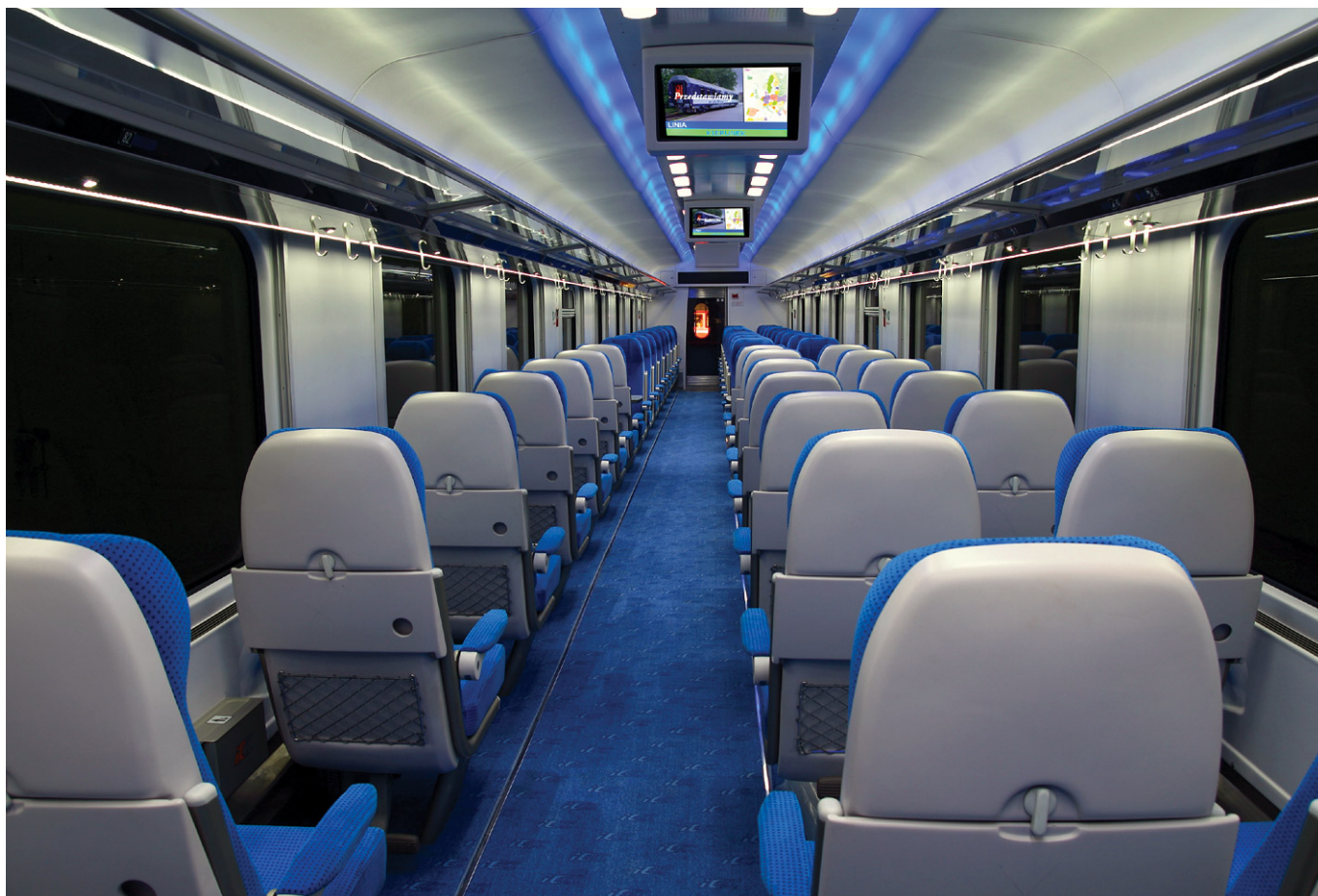
Inside a cinema carriage