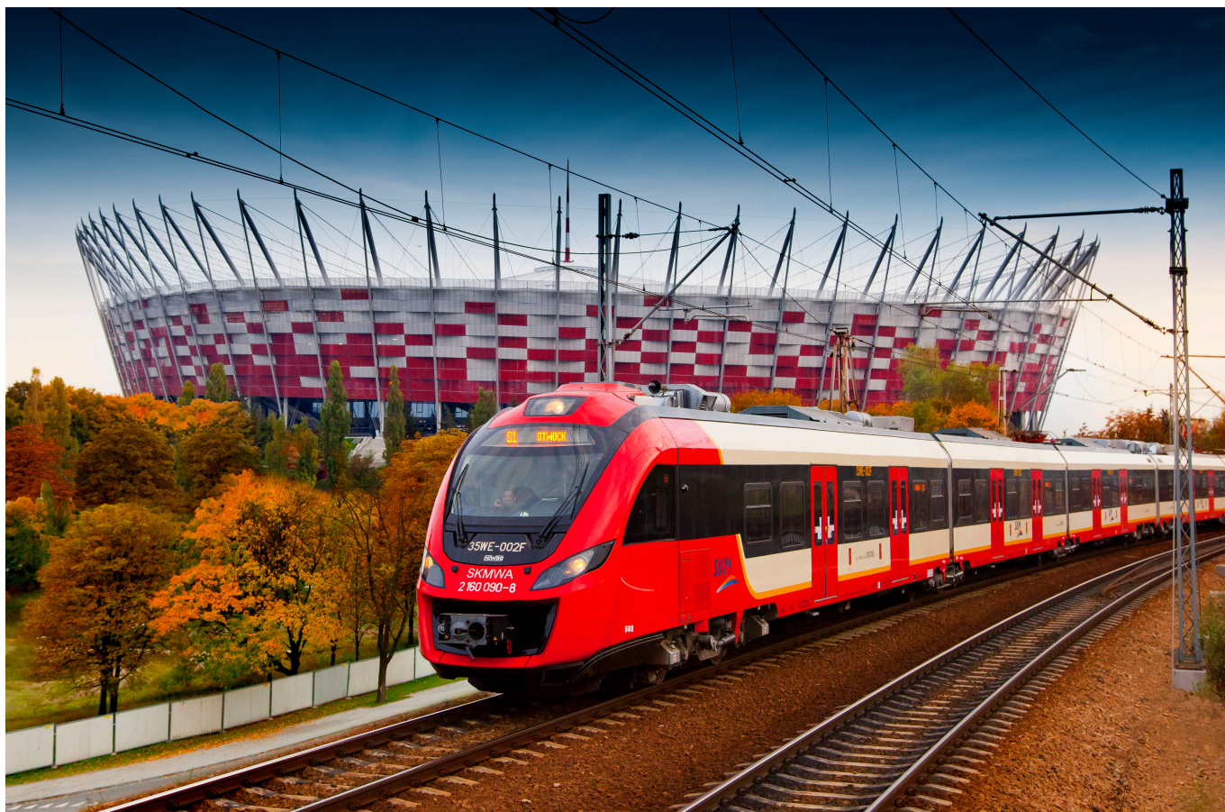
SKM passenger train entering Warszawa Stadion station